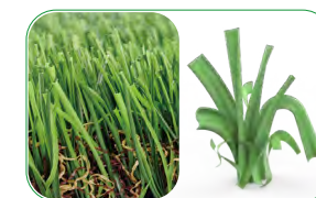
S-shape blade + Thatch