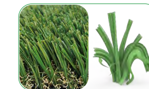
Double W-shape blade + Thatch