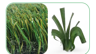
Stem blade + Thatch