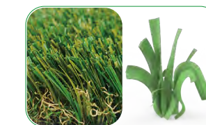
C-shape blade + Thatch